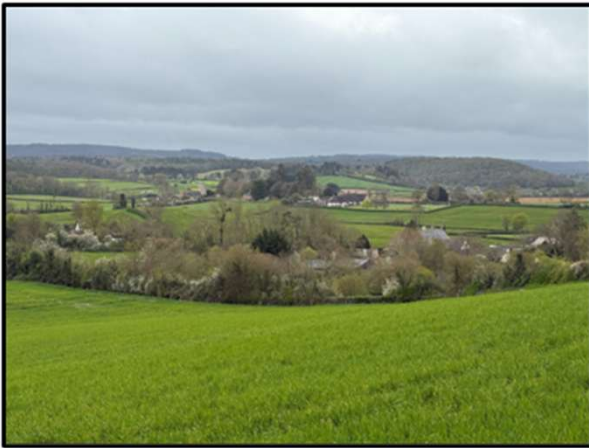
Blackdown Vale from Stoke Hill across to Orchard Portman